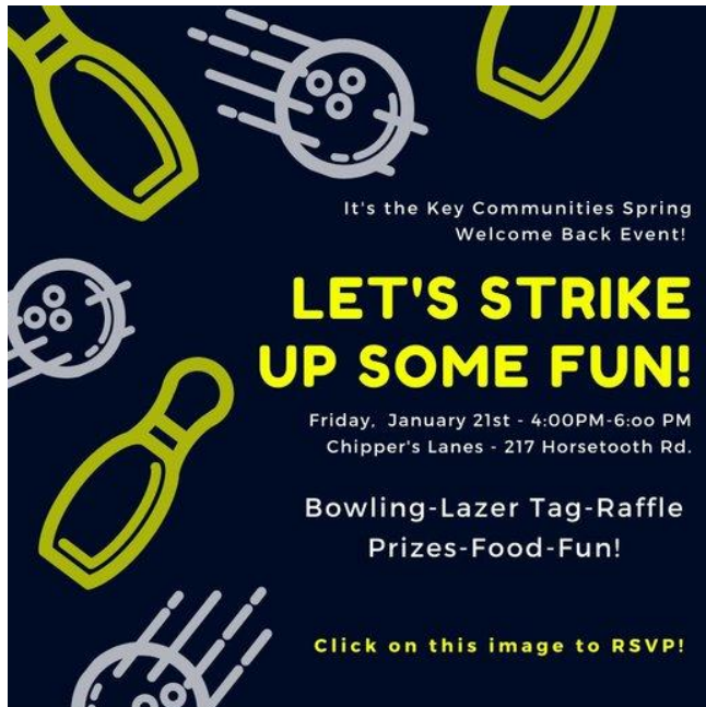
[Image Description: Navy blue background with yellow and grey bowling pins and balls with yellow and grey text that includes event information.]